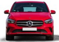
Mercedes-Benz B Class