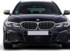
BMW 3 Series