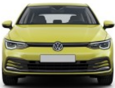
VW Golf 8