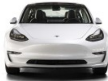
Tesla Model 3